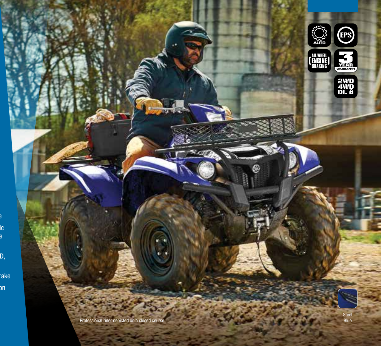
Professional rider depicted on a closed course.

Electric Power Steering (EPS) as standard