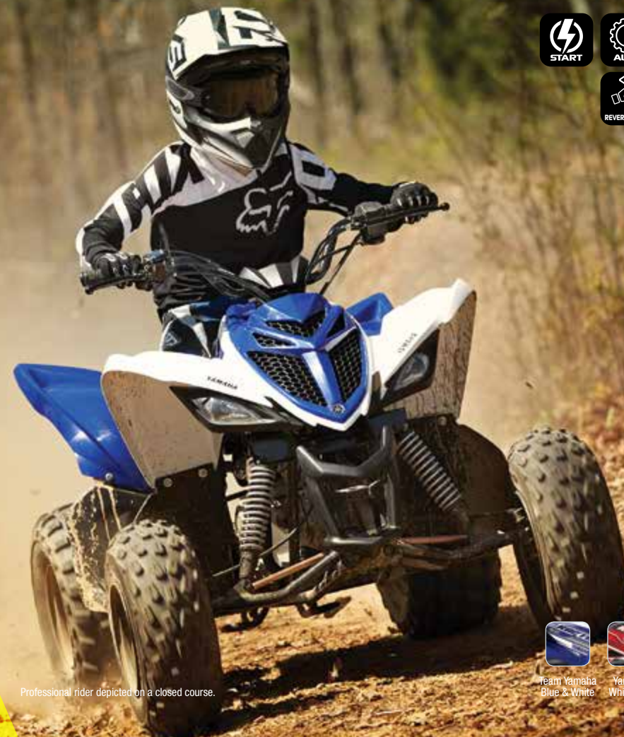
Professional rider depicted on a closed course.