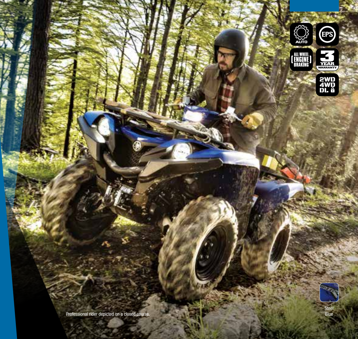
Professional rider depicted on a closed course.