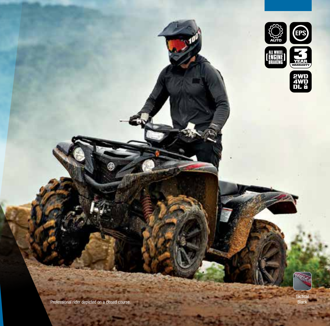
Professional rider depicted on a closed course.