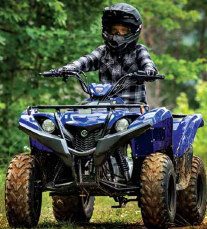
Professional rider depicted on a closed course.

Terrain grabbing 19-inch front and 18-inch rear tyres