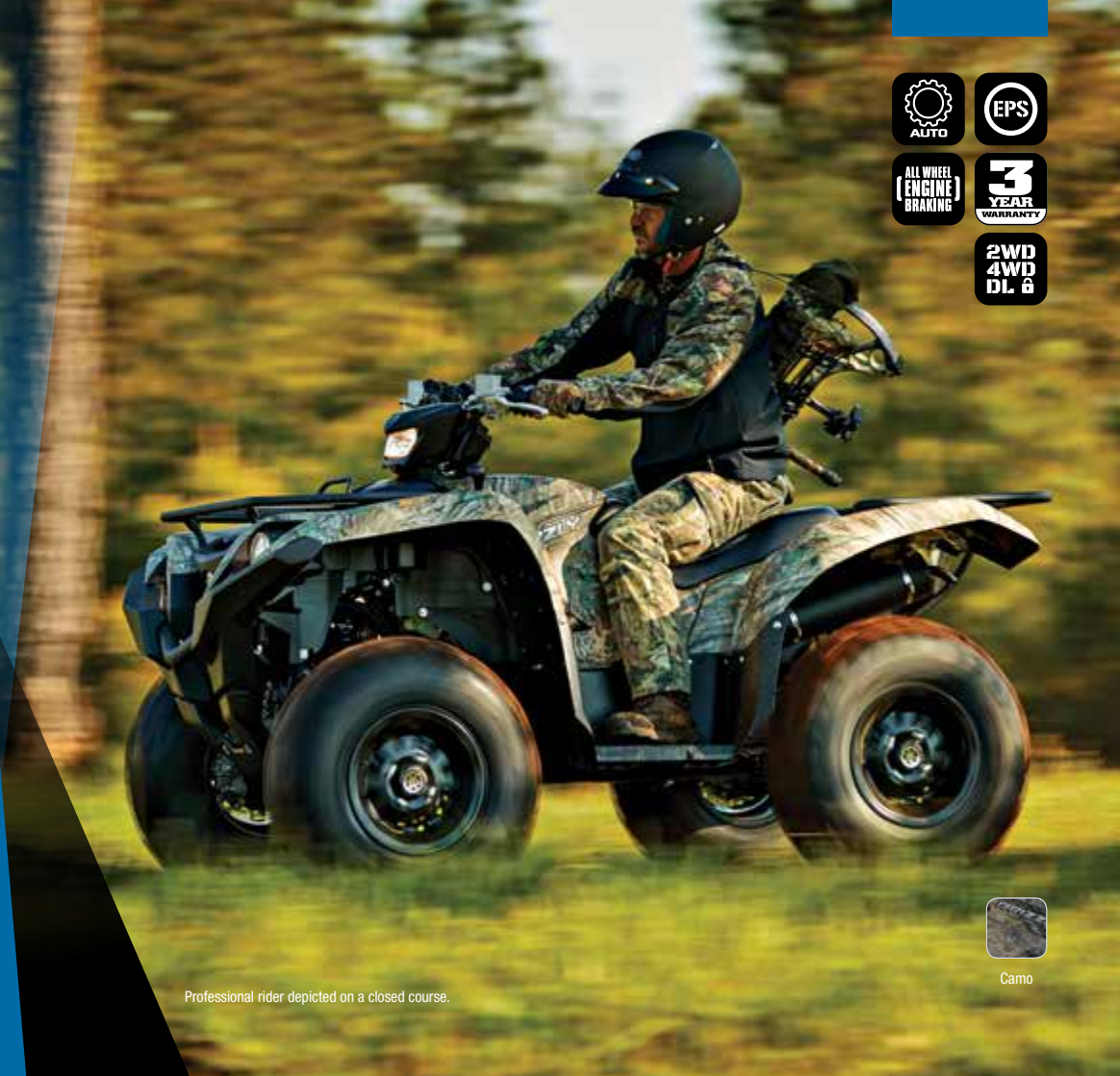
Professional rider depicted on a closed course.