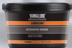
ACC-ULTRA-GS-16 (453gm Tub)

Specially formulated for use in the Grizzly ATV automatic clutch. Special lubricants ensure proper protection from wear, rust and corrosion. Protects critical clutch components during operation.