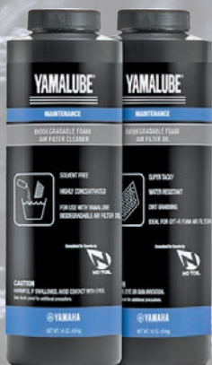
ACC-BIFMF-LT-KT (2 x 473ml)

This kit contains dirt-grabbing, water resistant, super-tacky filter oil and a non-alcohol-based heavy duty concentrated, detergent specifically developed to clean foam air filters treated with this oil. Yamalube Biodegradable Foam Air Filter Oil can only be washed out with Yamalube Biodegradable Foam Air Filter Cleaner and water. It won't wash out with petrol, solvents or water alone.